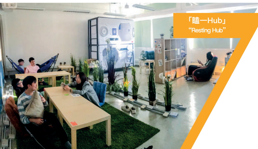
「瞓一Hub」 “Resting Hub”

設置一個舒適悠閒的場所，讓同學可以小睡片刻，以達至改善學生睡眠質素。這裡亦提供舒緩情緒與壓力的方法，以培養學生有優質之精神健康。這房間讓同學關注個人的睡眠質素及心理健康，提昇對珍愛生命的積極性。