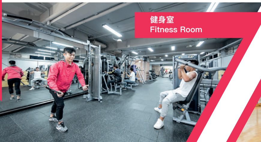
健身室 Fitness Room