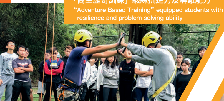
「高空歷奇訓練」緞練抗逆力及解難能力 “Adventure Based Training” equipped students with resilience and problem solving ability