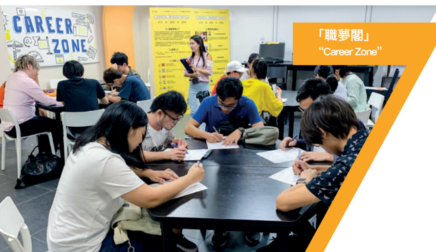
「職夢閣」 “Career Zone”

透過輕鬆有趣的桌上遊戲，讓學生認識工作世界，加深對自己的了解，更有效促進朋輩溝通和互動。職夢閣也提供面試及職場技巧之訓練，為學生將來投身社會作好準備。