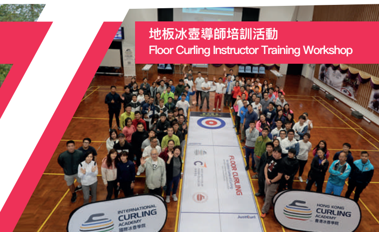
地板冰壺導師培訓活動 Floor Curling Instructor Training Workshop

Students won an award in the Tianfu Greenway International Cycling Fans Fitness Festival which was held in Chengdu, Sichuan.