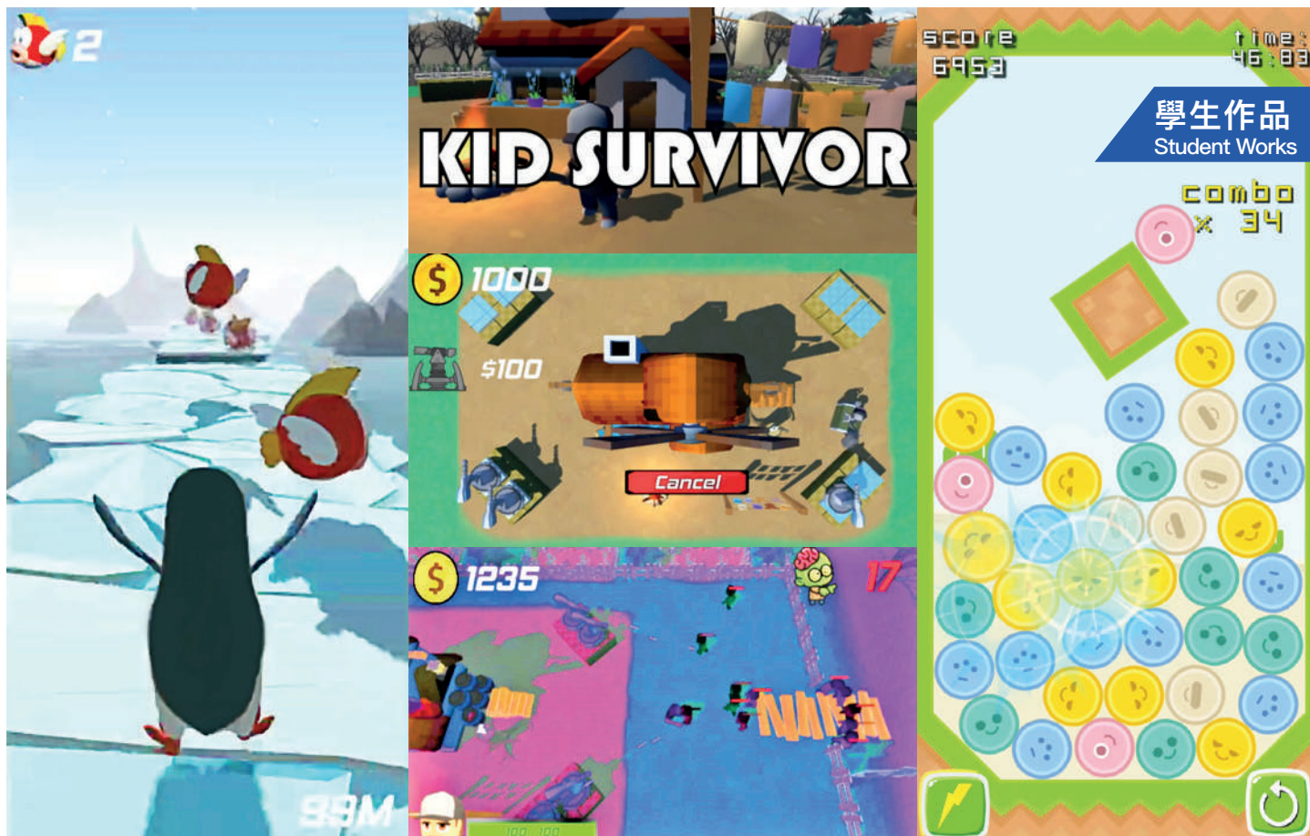
學生運用 Unity 和 3ds Max 創作不同類型手機遊戲 Students make different types of mobile games using Unity and 3ds Max.