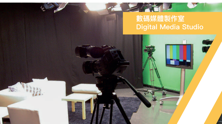
數碼媒體製作室 Digital Media Studio

Developed based on core concepts of creativity, culture and aesthetics, this is a modern and stylish space for students to discuss, brain storming and develop their own projects. Students can also share ideas about life, art and popular culture to boost peers' creativity. (3D Printer inside).