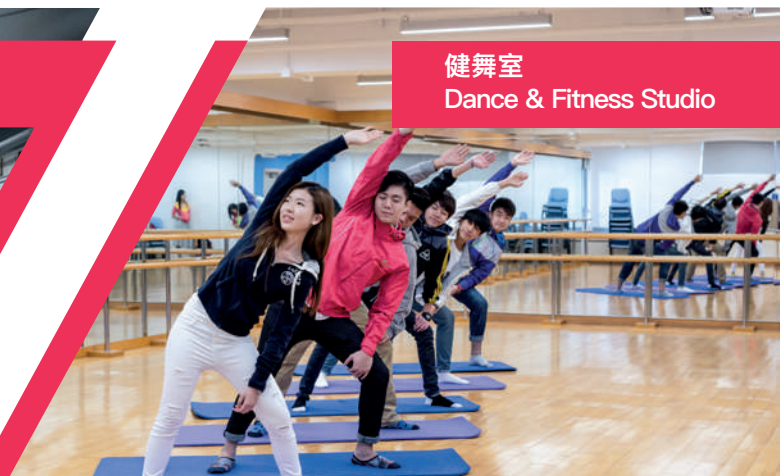
健舞室 Dance & Fitness Studio

Fitness Room is equipped with professional physical fitness equipment for students and staff to carry out multi-functional training in different aspects.