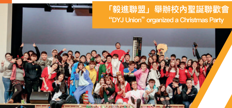
「毅進聯盟」舉辦校內聖誕聯歡會 “DYJ Union” organized a Christmas Party

Student Centre is a place gathering students to play, engage with each other, or have fun with different board games, musical instrument and magazines provided by the Centre. The team serving in Student Centre is mainly from social work and counselling background and they are willing to help students in difficulties. In addition, they will develop students through practical experience by holding different types of activity.