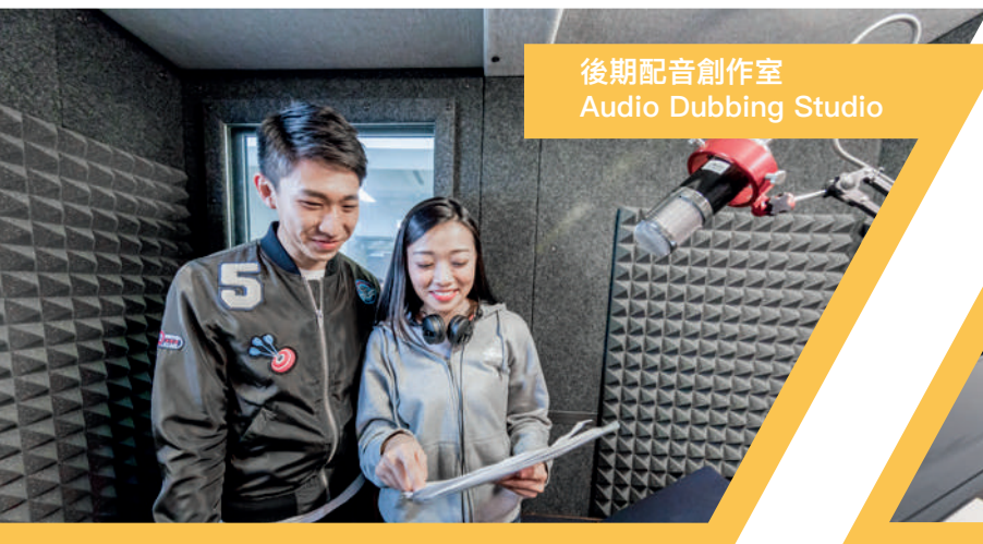
後期配音創作室 Audio Dubbing Studio

配音及混錄是電影及電視常見的後期製作工序，同學可在此專業錄音室製作旁述、聲效混錄及多聲道錄音。