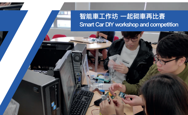
智能車工作坊 一起砌車再比賽 Smart Car DIY workshop and competition