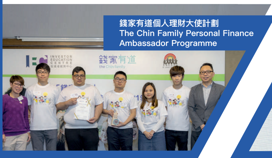
錢家有道個人理財大使計劃 The Chin Family Personal Finance Ambassador Programme

A series of talks including intellectual property talk, commercial development platform demo, Internet of Things, Unity, Unreal Engine, AR and Steam VR workshops.