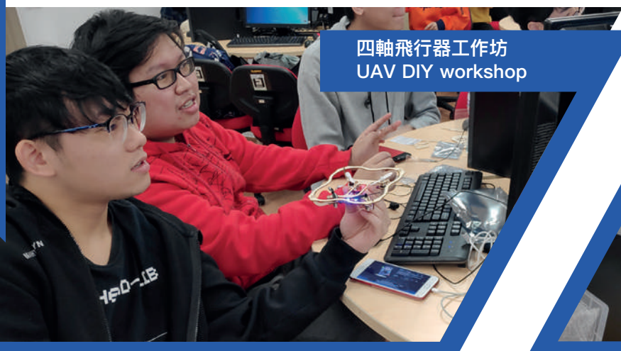
四軸飛行器工作坊 UAV DIY workshop