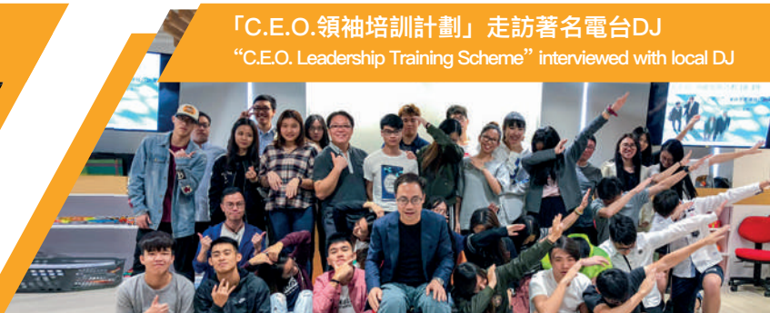
「C.E.O.領袖培訓計劃」走訪著名電台DJ “C.E.O. Leadership Training Scheme” interviewed with local DJ