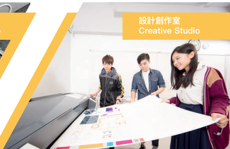
設計創作室 Creative Studio

Audio mixing and multitrack recording and industry-standard audio booth for audio dubbing and audio mixing; dubbing & mixing are the post-production process used in filmmaking and video production in which additional voices are mixed with original production sound to create the finished piece.