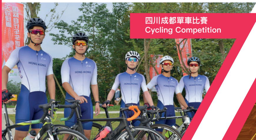
四川成都單車比賽 Cycling Competition

Dance & Fitness Studio provides a multi-functional area for dancing and other sports activities.