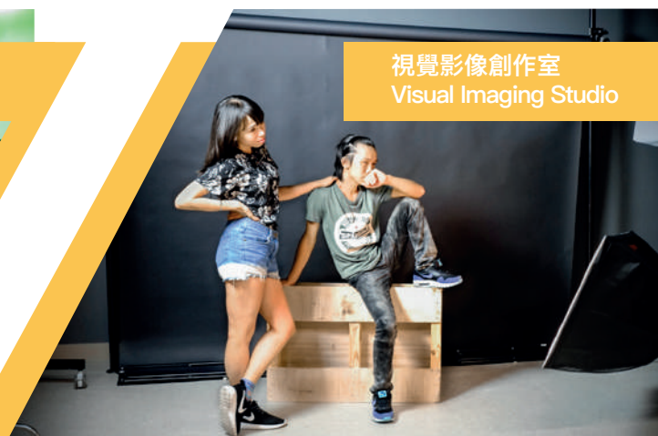
視覺影像創作室 Visual Imaging Studio

Houses a professional high definition TV studio and control room, enabling students to put into practice their classroom knowledge; Provide a live broadcast signal through industry standard HD-SDI with tapeless high definition camcorders and Audio & Visual equipments with professional standard.