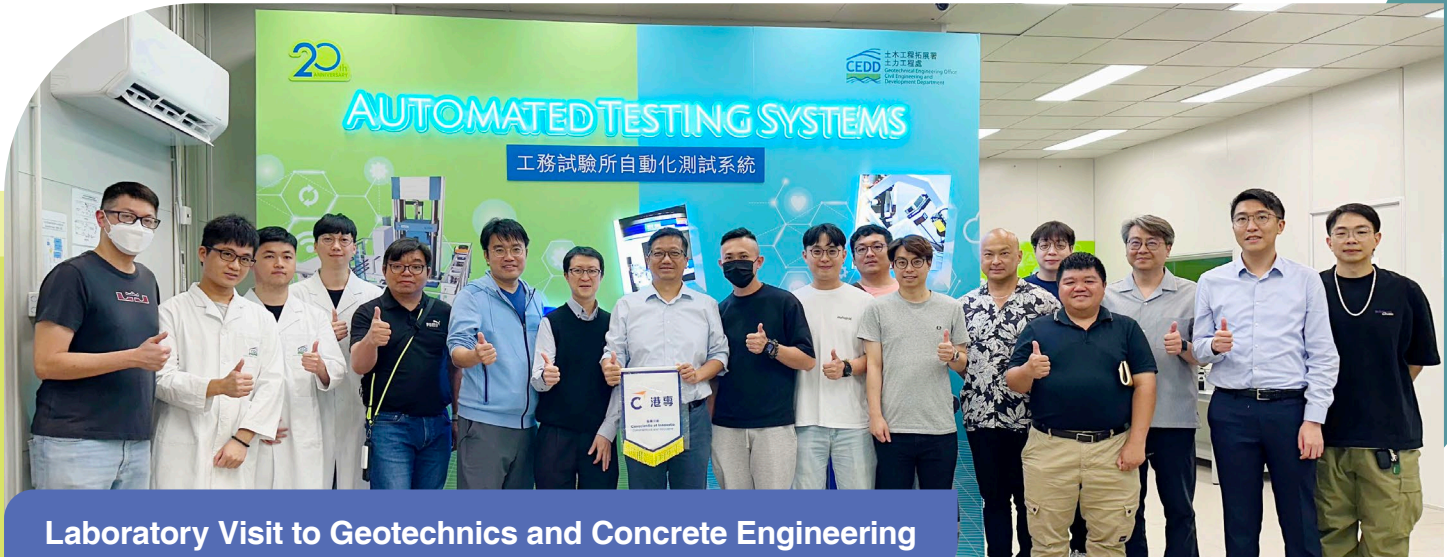
Laboratory Visit to Geotechnics and Concrete Engineering