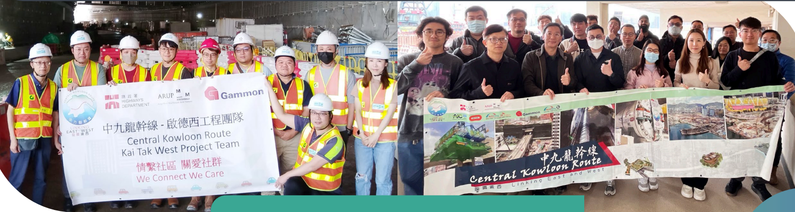
Academic Site Visit to Central Kowloon Route