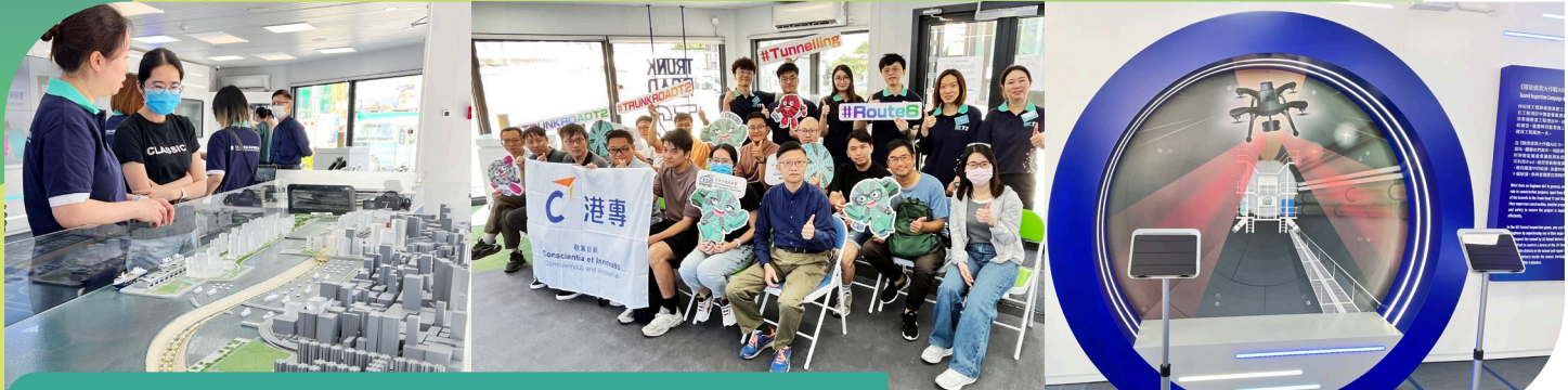
Site Visit to Trunk Road T2 & Cha Kwo Ling Tunnel